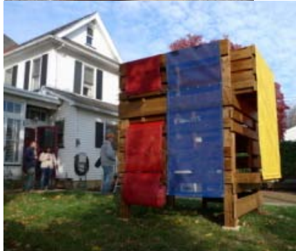
Above: Playhouse by Spillman Farmer Architects